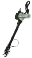
Maxis® XD1 Extreme Duty Circuit Puller