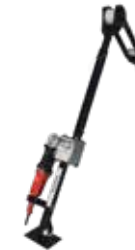
Maxis® 6K Cable Puller with Motor