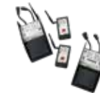
TRIGGERS® Wireless Safety Switch System