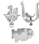
Bolted Framing Strut Fittings and Clamps