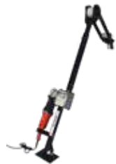
Maxis® 6K Cable Puller with Motor