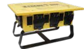
Temporary Power Boxes