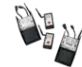
TRIGGERS® Wireless Safety Switch System