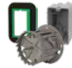
Non-Metallic Boxes and Covers