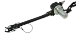
Maxis® XD1 Extreme Duty Circuit Puller