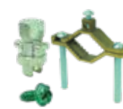
Grounding, Bonding, and Splicing