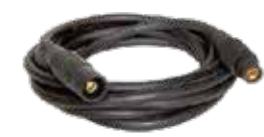
CAM-LOK Extension Cord