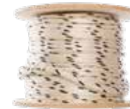
QWIKrope® Feeder Pulling Rope