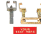
Panel and Breaker Accessories