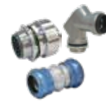
Commercial, Industrial, and Residential Fittings