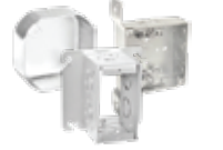
Steel Boxes, Covers, and Accessories