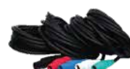
CAM-Type Tail Set